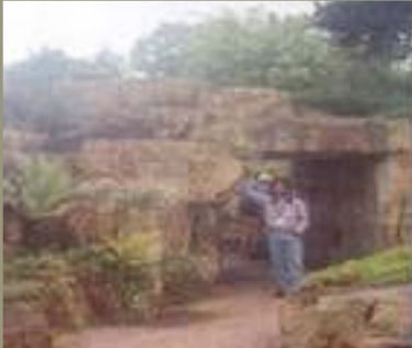
Visiting the world's largest dead and live plants collection in Kew Garden London UK.