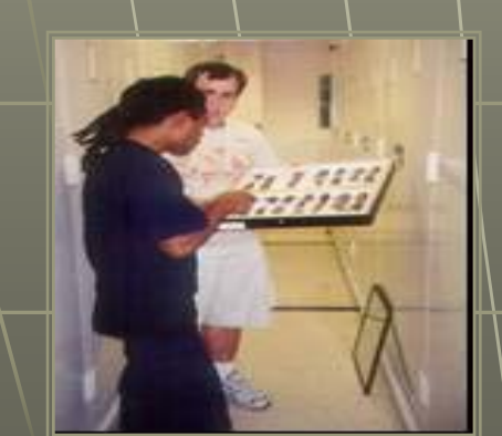
Looking at some of the Beetle collection in Smithsonian Natural History Museum USA America