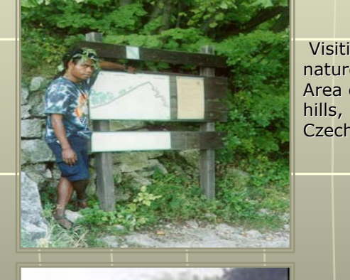
Visiting the nature reserve Area of Palava hills, Moravia Czech Republic

The training: how to collect and preserve and process insect samples for scientific use. How to use scientific equipment like electron microscopes etc. Using keys to identify plants and insects