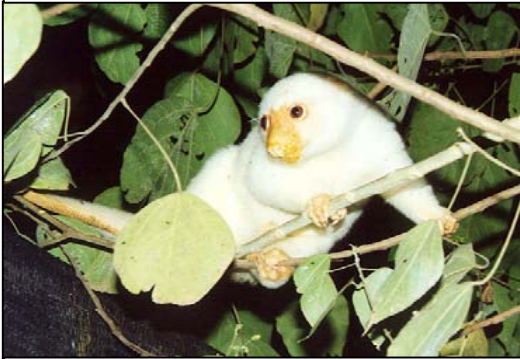
Kapul bilong diwai