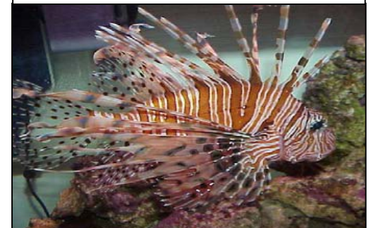
Lion fish bilong solwara